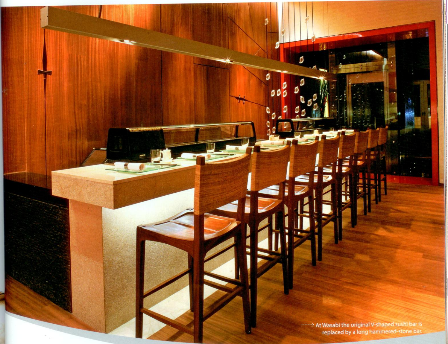
-----> At Wasabi the original V-shaped sushi bar is replaced by a long hammered-stone bar.