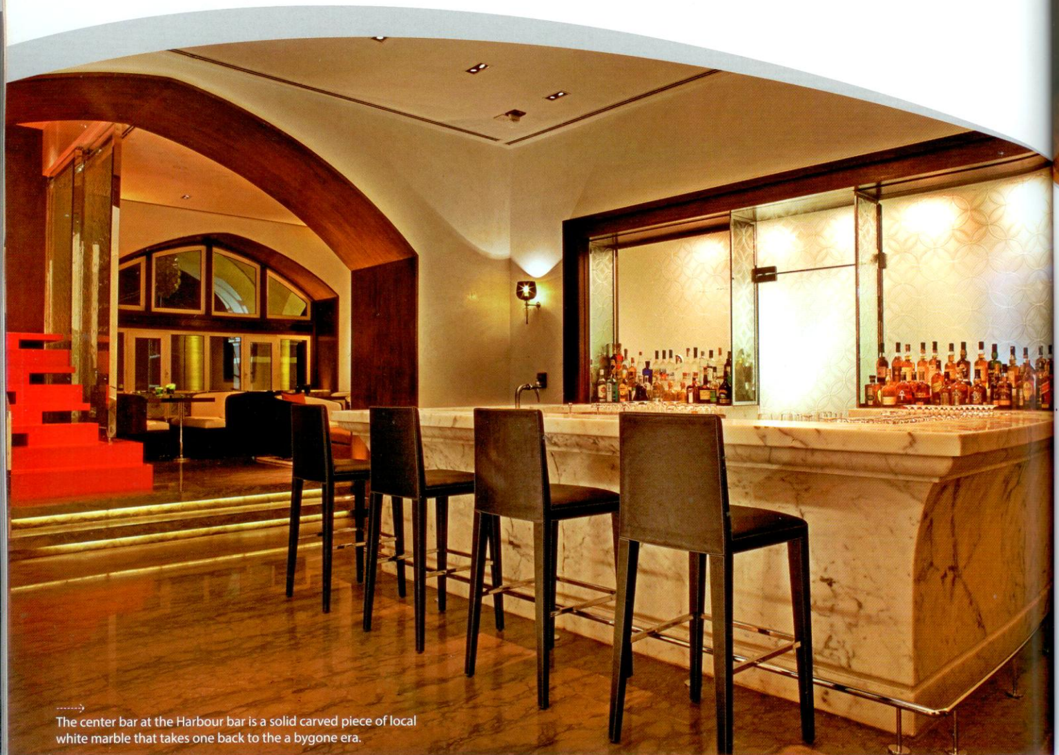
The center bar at the Harbour bar is a solid carved piece of local white marble that takes one back to the a bygone era.

We completed the rebuild of Harbour Bar and Wasabi by Morimoto one year after 26/11. So many of the people we worked with were still healing. I'll always admire their courage and strength during that period of profound tragedy and loss.