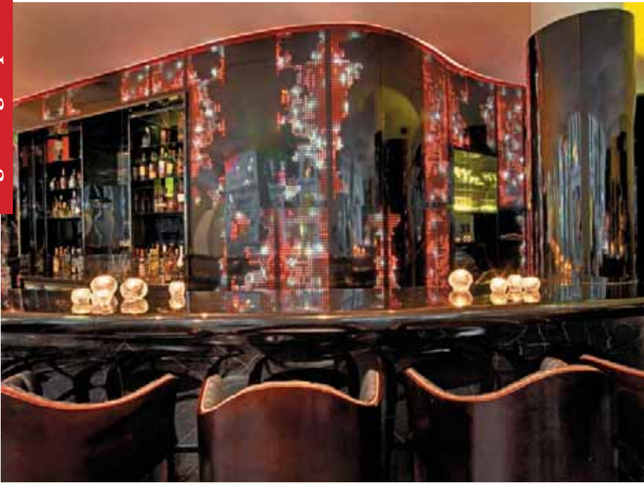
↑ The shape of the bar counter also appears to be transformed and molten due to the 'effect' of the light emitted by The Spark.